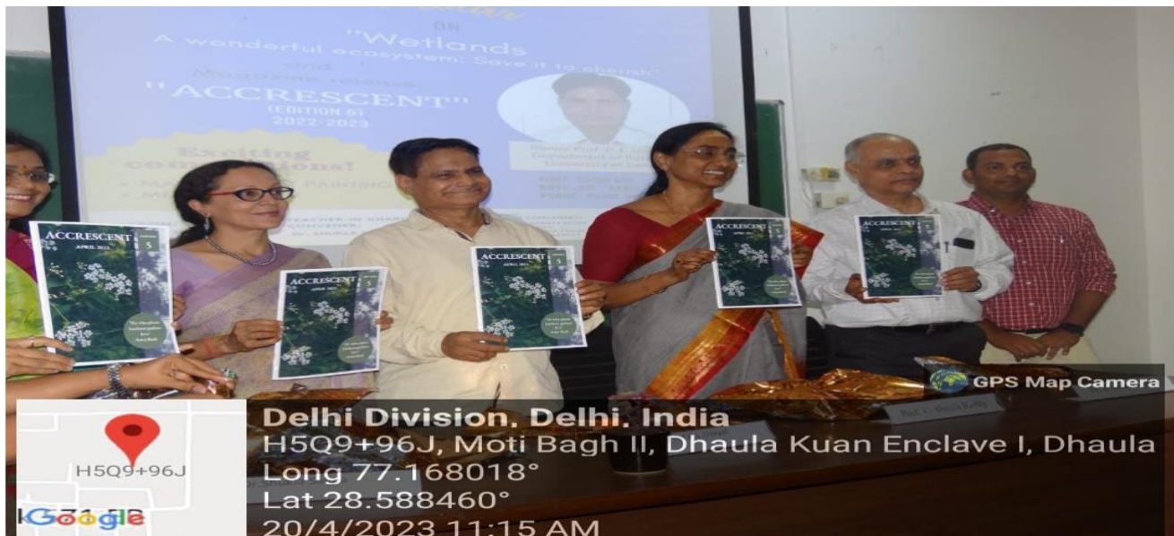
Launch of the 5 th edition of Accrescent