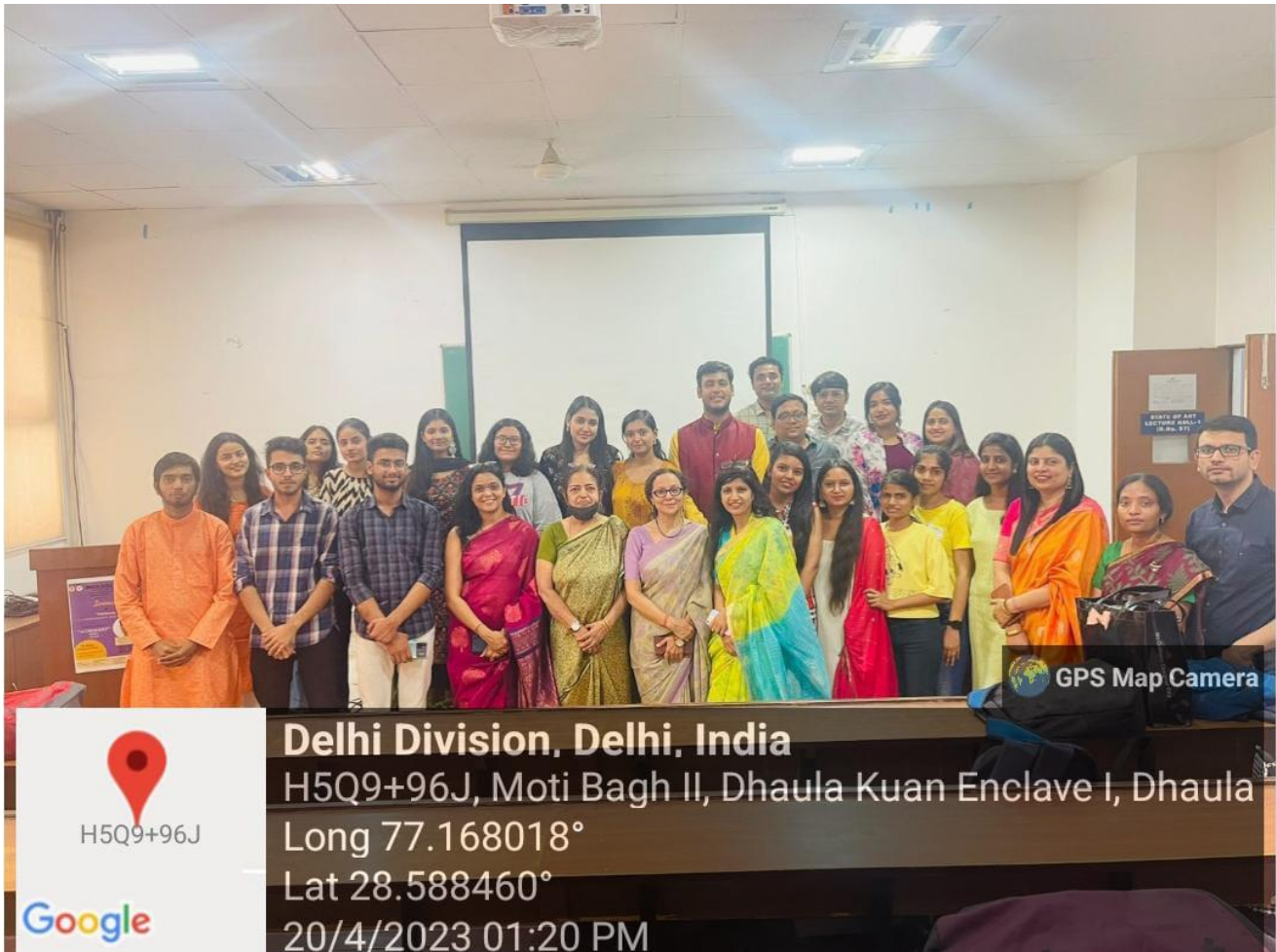
Group photograph with the staff and the students.